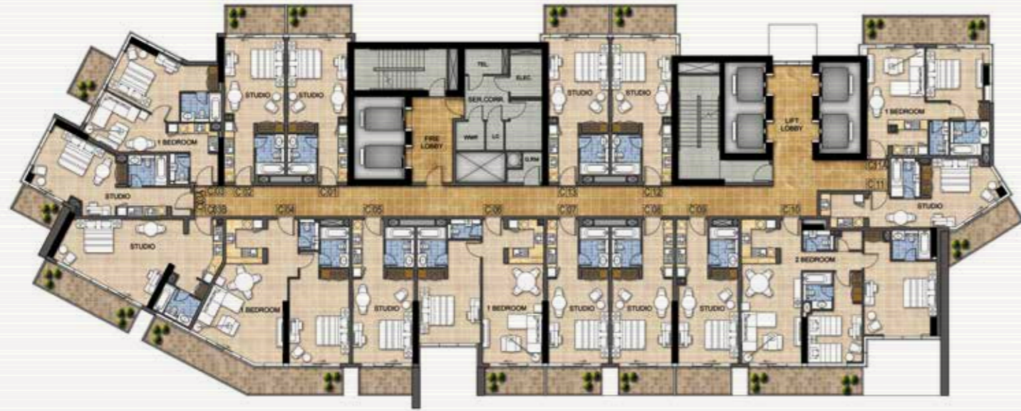
LEVELS 4-7 9-10 12-13 & 15