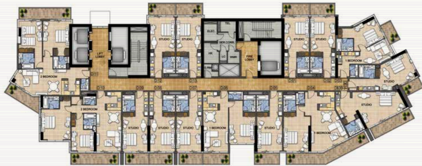
LEVELS 4-6 9-12